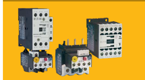
NEMA® motor control and protection