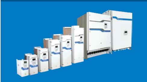
Enclosed starters and VFDs